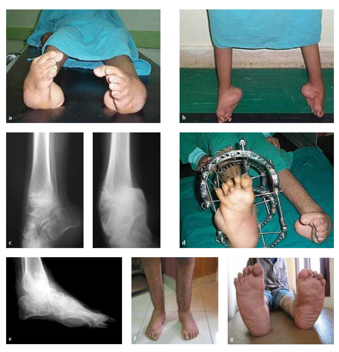
Fig. 3. — a and b) Preoperative appearance of the patient, c) Preoperative radiograph, d) Right side in the frame, e) Postoperative radiograph, f and g) After correction of both feet.

In 1993, Paley (12) reported on 25 complex foot deformities treated by Ilizarov distraction osteotomies. He used more than one type of osteotomy, such as supramalleolar, U, V, posterior calcaneal, talocalcaneal neck, midfoot, and