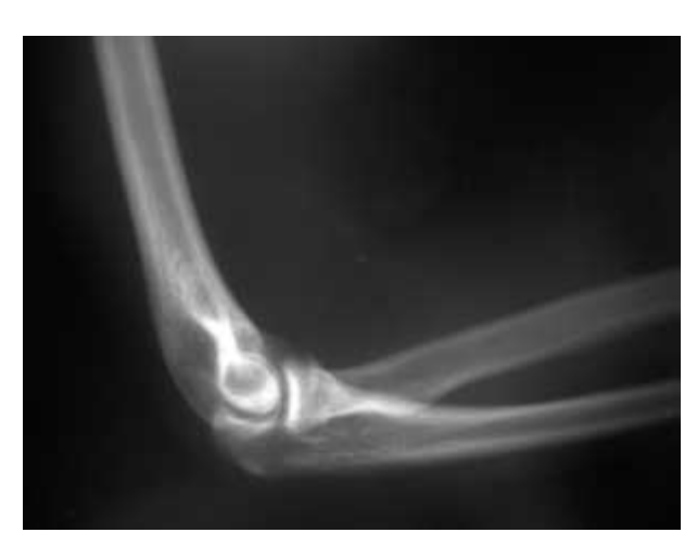
Fig. 3. — Intraoperative lateral radiograph of the patient's elbow at the end of the procedure.

Surgical removal of the necrotic skin, the involved subcutaneous tissue and granuloma was per-