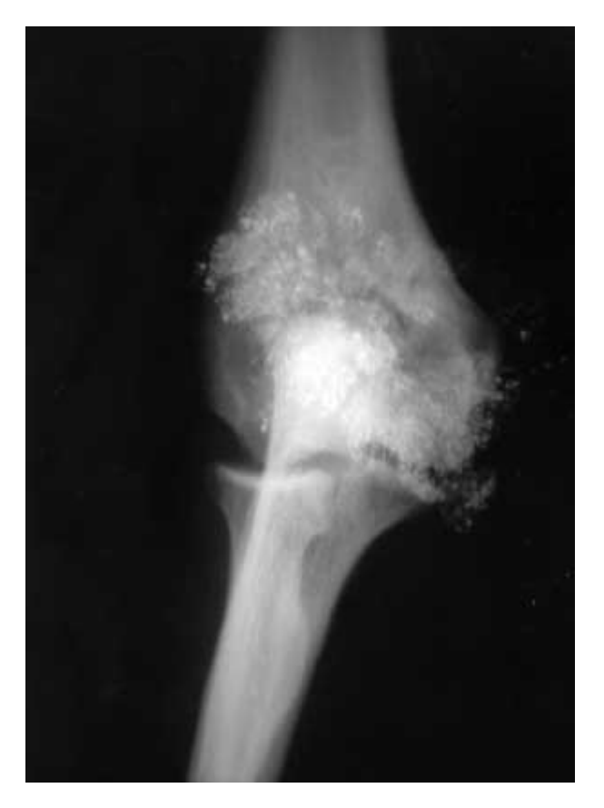
Fig. 1. — Preoperative anteroposterior radiograph of the patient's left elbow.