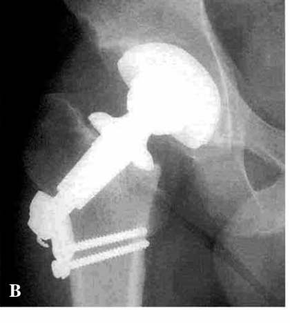
Fig. 1. — This patient aged 33 years developed loosening at 68 months (A) and was revised to an uncemented Zweymüller femoral stem (C). The acetabular cup was well fixed and did not require revision. The thrust plate was not seated well on the neck as seen on the immediate post-operative radiograph (B). The proximal femoral bone stock is well preserved.