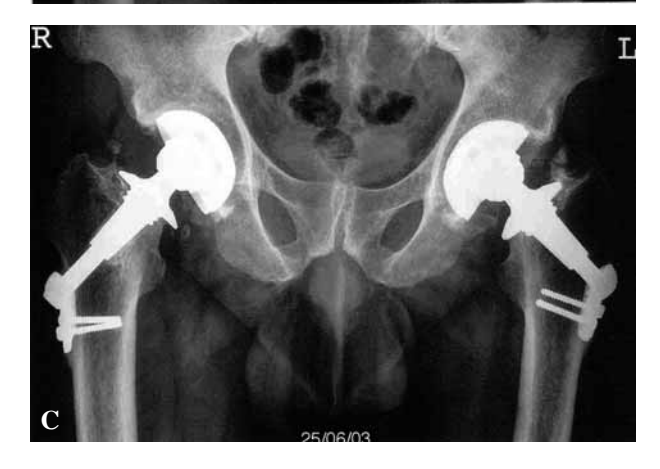
Fig. 2. — This patient aged 48 years underwent bilateral TPP at the same sitting (A). Subsequent radiographs at 3 years (B) and 5 years (C) follow-up do not show any signs of loosening at five years.

and was reduced by open reduction. The acetabular cup was found to have an excessive anteversion, which was corrected. Both of these patients did not have any further problems, the former is now 5.25 yrs and the latter 4.25 yrs post surgery. One