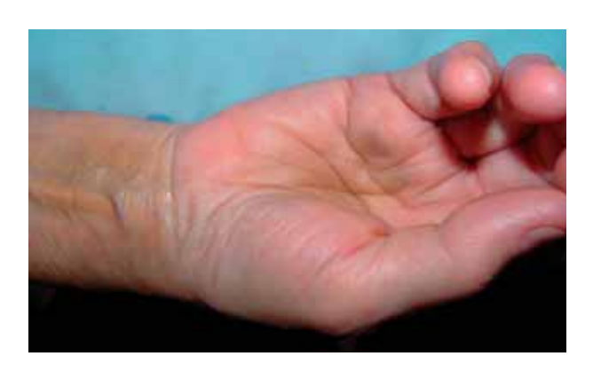
Fig. 1. — Photograph of the hand showing the flexed attitude of the fingers and bruising of the base of the hand and wrist.

She was admitted to the hospital for control of INR, analgesia and surgical decompression. Intraoperatively a haematoma was found anterior to the Pronator Quadratus. She was operated on the 4th day with successful relief of symptoms. Her sensations returned to normal with full movement of the fingers. Three months following the surgery she has no residual neurological deficit.