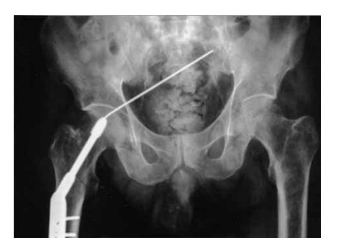
Fig. 1. — Immediate post-operative radiograph of the right hip showing intrapelvic migration of the threaded guide wire.

post-operative complications (fig 3). The progress of the patient over a 3-year follow-up was unaffected by this complication.