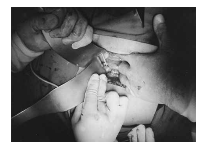
Fig. 2. — The guide wire as seen during laparotomy

Several types of hip screws and instrumentation systems are available on the market place and each one provides its own guide wires and mechanisms for their correct placement in the femoral head. It is