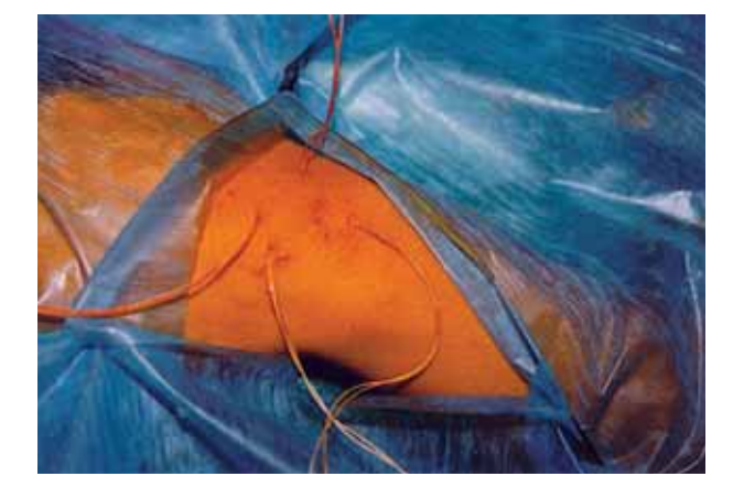
Fig. 4. — Linen thread passed in criss-cross manner; expelled mucinous contents can be seen at the points of entry of thread..