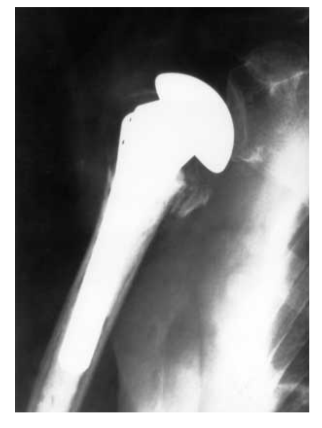
Fig. 2. — Example of a cemented Aequalis prosthesis used for the treatment of a four-part fracture of the proximal humerus.

Under general anaesthesia, with the patient in a beach chair position, and the arm draped free beyond the edge of the table, the fracture was exposed using a deltopectoral approach. The deltoid was carefully kept intact, without damaging its origin or its fibers. The long biceps tendon was used as a guide for the groove between