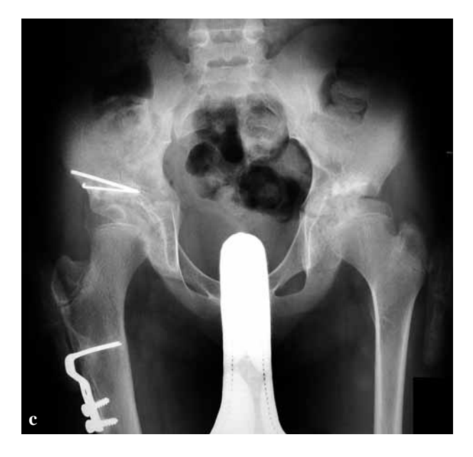
Fig. 1. — a) Preoperative radiograph of a 3-year-old child with developmental dislocation of the right hip; b) Five months after combined surgical treatment was performed; c) Eight years after operation, the implants had not been yet removed because of parents' neglect. Clinical result was excellent.

associated with derotation osteotomy and, when necessary, with varus osteotomy (1, 4, 5, 7, 12, 15, 18, 19, 31). On the other hand, there is a number of studies in which the treatment in children who range from 1.5 to 7 years of age is combined open reduction and pelvic osteotomy without femoral shortening (8-10, 16, 28).