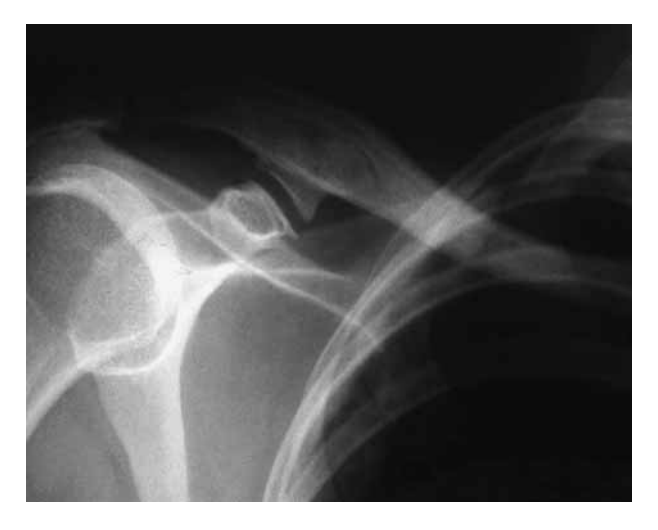
Fig. 1. — Standard antero-posterior radiograph of the shoulder. The coracoclavicular joint, with lipping of the articular surfaces and osteophytes, especially at the medial part of the coracoid process, is noticed.