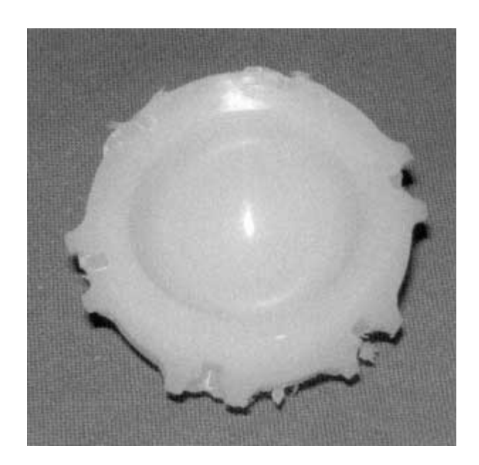
Fig. 3. — The dissociated polyethylene liner. Examination of the liner revealed irregularity of the slots around the rim where it had been attached to the cup with peripheral screws.