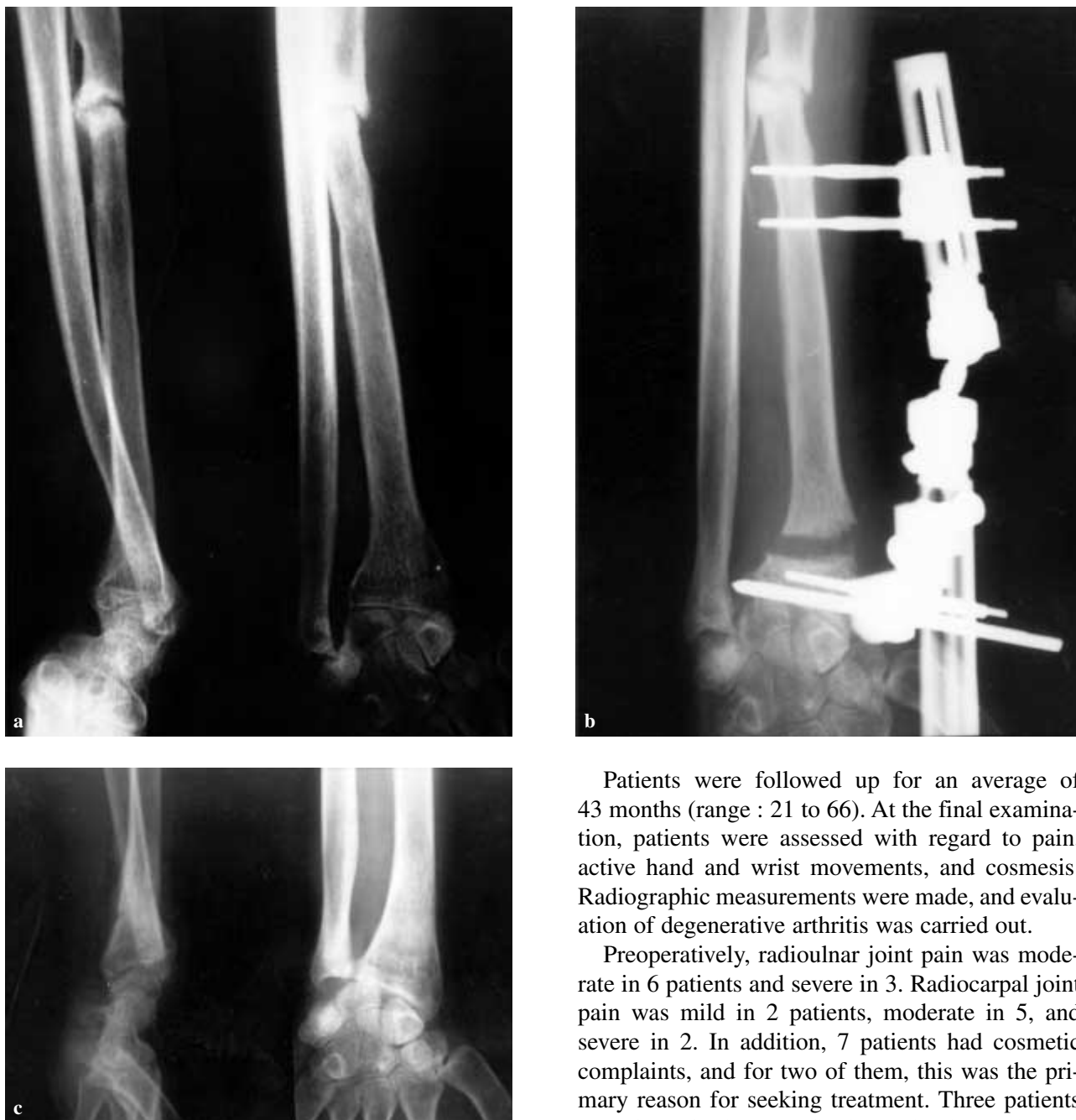
Fig. 1a. — Preoperative anteroposterior and lateral X-ray of a patient with malunion in the distal radius and nonunion in the diaphysis associated with a segmental fracture in the radius (case 4). b : Ulnar translation of the distal fragment occurred during distraction. c : Anteroposterior and lateral X-ray 6 months postoperatively. Radio-ulnar index : 0 mm. Volar inclination : 8°. Ulnar inclination : 19°. Diaphyseal nonunion healed.

Patients were followed up for an average of 43 months (range : 21 to 66). At the final examination, patients were assessed with regard to pain, active hand and wrist movements, and cosmesis. Radiographic measurements were made, and evaluation of degenerative arthritis was carried out.