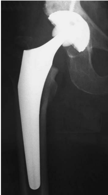
Fig. 1. — Uncemented total hip arthroplasty

compression screw was implanted. A hydroxyapatite coated femoral stem was introduced with correct anteversion. A ceramic 28 mm head with neutral neck length was used. Excellent range of motion and stability was obtained.