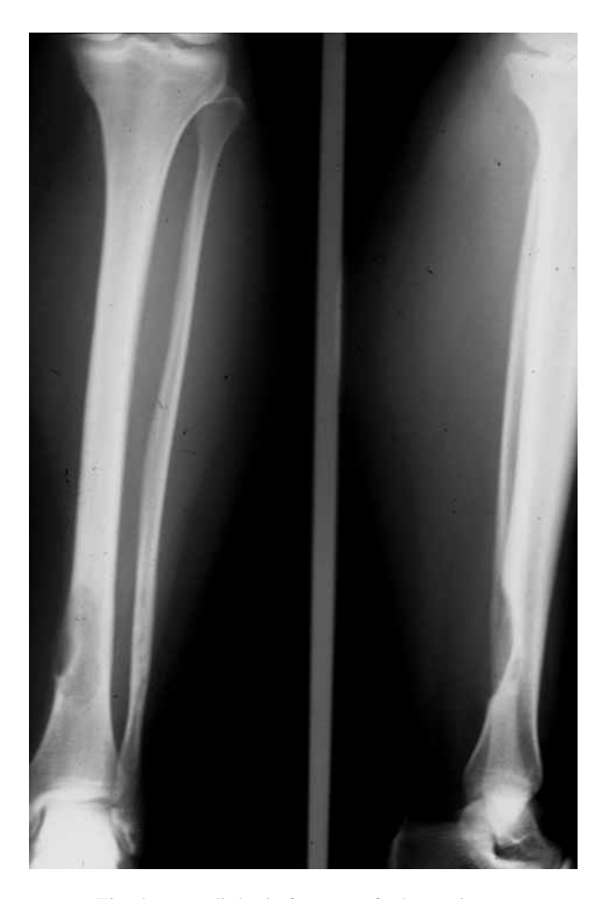
Fig. 1. — Radiologic features of adamantinoma

MRI may also reveal the exact location and volume of the tumour and clarify whether or not it has affected the surrounding soft tissues (53, 58).