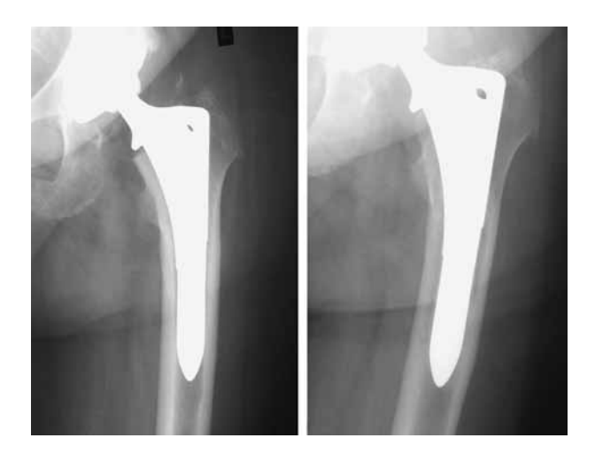
Fig. 2. — Radiographs of a 73-year-old woman with osteoarthritis postoperatively (a) and at 3 years (b), showing twothird proximally porous-coated stem. Good position of the stem and no signs of loosening. Slight resorption of the proximal part of the femoral neck is visible at three years. She has no pain with an excellent clinical result.

Kaplan-Meier survivorship analysis was used to estimate the cumulative probability of not having radiological loosening. The "best-case" scenario curve for the 98 hips was compared with the "worst-case" scenario curve including all patients in the series and considering losses to follow-up as failures (17). Qualitative data were compared using the chi-square test or Fisher's exact test, and quantitative data were compared with use of the Mann-Whitney U test. Spearman's correlation coefficient rho was used to measure correlations between different parameters. Statistical analysis was performed with the SPSS statistical package Version 10.0 (SPSS, Chicago, Illinois, USA) and XLSTAT 2007 (Addinsoft, Paris, France). Significance was defined as a p value of < 0.05.