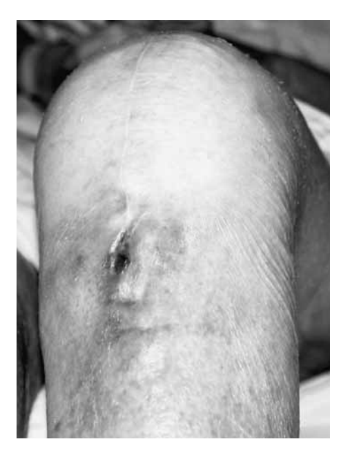
Fig. 3. — Chronic discharging tuberculous sinus over the knee

and this should be investigated in relevant cases (1).