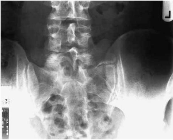
Fig. 1. — Plain A-P radiograph of a patient without low back pain and with a unilateral (left-sided) LSTV, type IIa according to Castellvi.