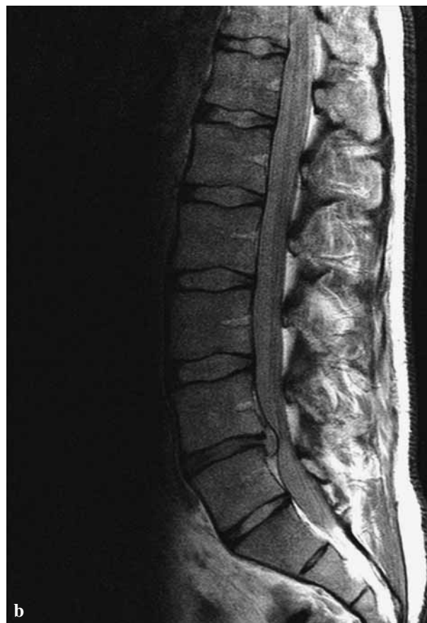
Fig. 3. — (a) Plain A-P radiograph of a patient with low back pain without radiculopathy and a unilateral (left-sided) LSTV, type IIa according to Castellvi ; (b) T1-weighted sagittal MRI scan of the same patient, showing a disc herniation, typically above the LSTV.

according to Castellvi. The sagittal scans of the sacrum were separated into four types (1-4) according to the appearance of the disc between the uppermost sacral segment and the remainder of the sacrum. This demonstrated a good correlation between the presence of a fused LSTV (Castellvi type III or IV) and a type 4. However, patients with Castellvi types Ia or IIb LSTV were not identified with this method (30,44). Another MRI method for defining the lumbar levels is using C2 as a landmark, which is based on the assumption that there are always 7 cervical and 12 thoracic vertebrae (12,25,44,48). Hahn et al (25) made a cervicothoracic scout MRI in every patient and counted caudally from C2. They identified 24 cases of LSTV in 200 patients (12%). Moreover, they stated that consistently accurate verification of the actual level of disc disease outweighs the additional time and efforts that are required. Peh et al (48) found an 11.6% interobserver discordance in assessment of