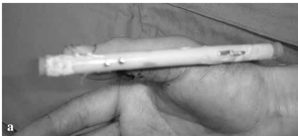
Fig. 4. — Clinical photographs with the fixator in situ showing a healing wound on the radial aspect of the thumb.