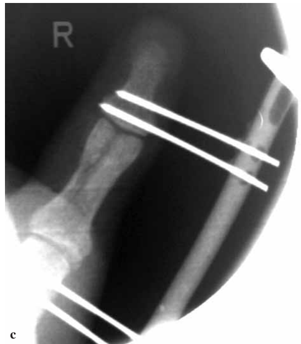
Fig. 3. — Intraoperative images. This construct was used to span two joints as the fracture line extended into the metacarpophalangeal and interphalangeal joints of the thumb. The two lateral view images are 1) without fixator 2) with radiolucent fixator in situ .

and around the pin sites to contain any extruding cement. Elevation of the finger helps by gravity assisted filling of the tube. Once the entire tube fills with cement, caps are applied at both ends and the cement allowed to harden. The protruding end of the K-wires can be cut flush with the tube or left 1 cm proud and covered with bone cement before it hardens. This prevents damage from sharp points on the fixator construct. Excess cement extruding from the tube at K-wire sites is cleared while still soft. Once the cement hardens this fixator provides stable fixation of the fractured digit (fig 4).