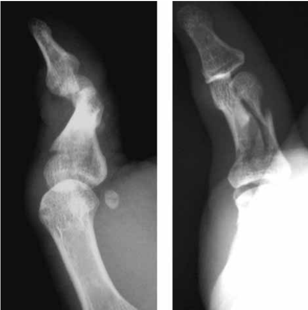
Fig. 1. — Radiographs showing a comminuted fracture of the proximal phalanx of the thumb with an associated fracture dislocation of the interphalangeal joint.