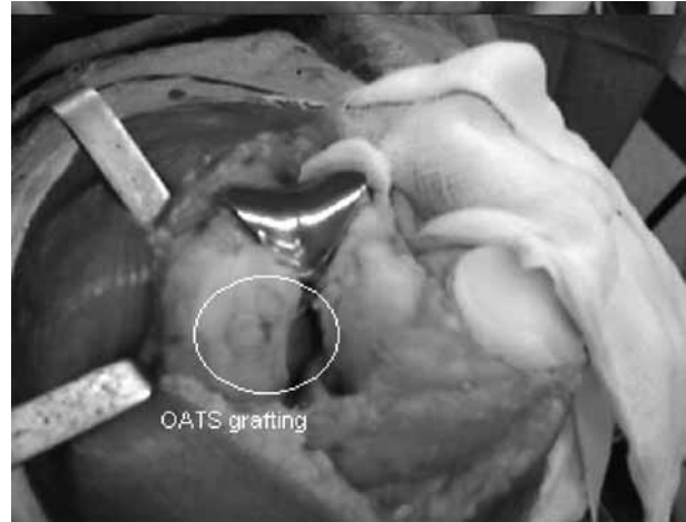
Fig. 2. — Patellofemoral replacement with concomitant OATS grafting.

Postoperative inpatient stay was 7 days on an average. However with the introduction of our community based nursing scheme since the last few years, the current average inpatient stay is only 3 days postoperatively. Patients were seen at 6 weeks, 6 months, one year postoperatively in the outpatient department and then annually. The average duration of follow-up in our series was 48 months (range 6-96 months). No patients had been lost to follow-up. During these visits, further symptoms were elicited and a clinico-radiological assessment was carefully performed. There was no mechanical failure or loosening of any of the implants radiologically.