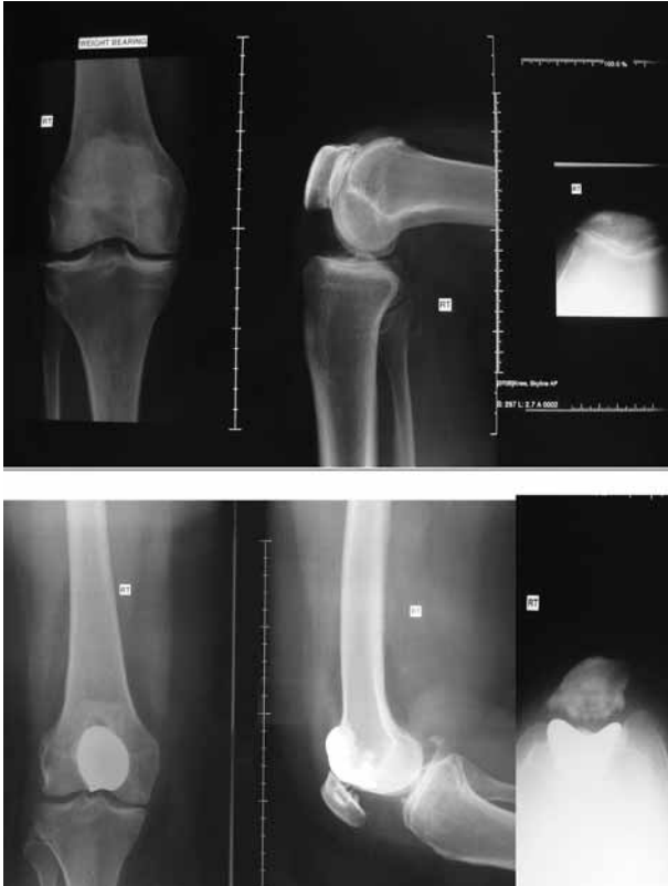
Fig. 1. — Pre-operative and four year post-operative radiographs for an isolated symptomatic patellofemoral arthritic joint.

simultaneous osteochondral autograft transfer system (OATS) procedure along with the patellofemoral joint replacement (fig 2).