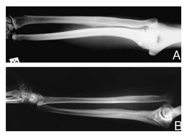
Fig. 2. — Anteroposterior (A) and lateral (B) views of the forearm showing proximal and distal radioulnar dislocations, and bowing of the ulna.