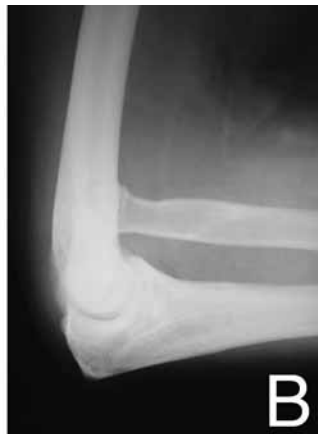
Fig. 3. — Radiographic views focusing on the elbow (A, B).

normal. The lateral elbow radiograph with the elbow flexed over 90° confirmed the anterolateral displaced position of the radial head (fig 3B). Despite the chronic dislocation of the distal radioulnar joint no arthritic changes were noted in the radiocarpal joint.