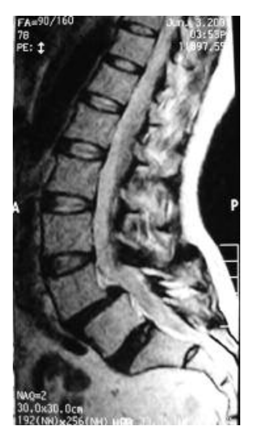
Fig. 1. — Preoperative MRI showing a low grade lytic spondy-lolisthesis L4L5.

unilateral TLIF using a single cage with adjunctive pedicular fixation in the management of low grade lytic spondylolisthesis.