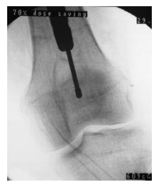
Fig. 1. — Intra-operative fluoroscopic image showing introduction of fish hook wire into the distal part of a broken intramedullary femoral nail.

nail. Both nails were Smith & Nephew's standard femoral locking intramedullary nails.