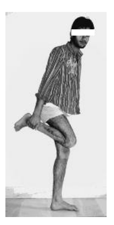
Fig. 7. — Clinical photograph showing range of motion of ipsilateral knee.