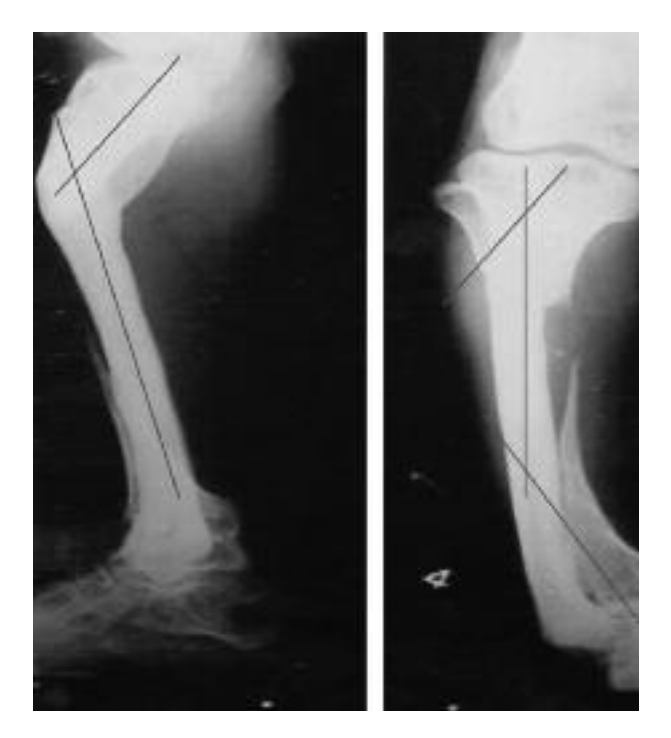
Fig. 2. — Preoperative radiograph of the patient showing deformity and two centers of rotation of angulations (CORA).

Radiographs of the whole limb were taken to assess the deformities and the deranged mechanical