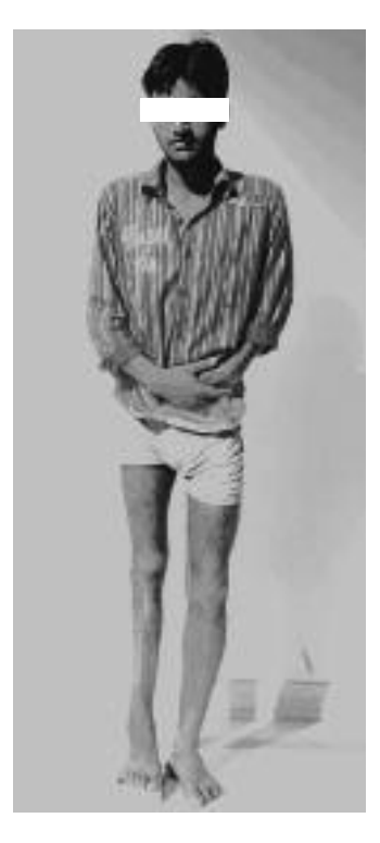
Fig. 6. — Limb length discrepancy corrected within two cm