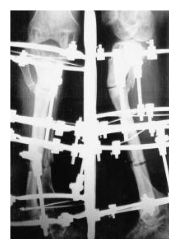
Fig. 3. — Postoperative radiograph : corticotomy performed at two proposed sites.