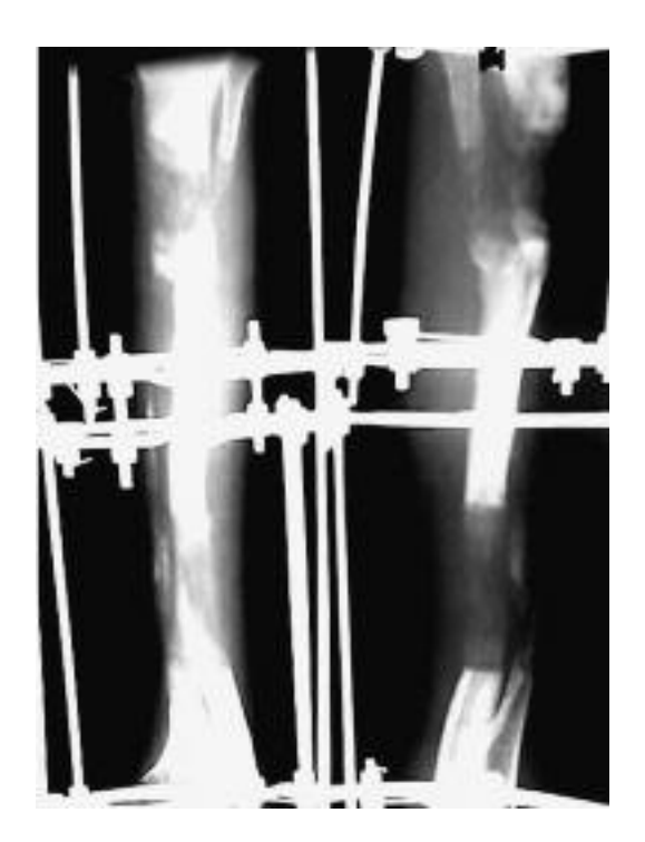
Fig. 4. — Radiograph during lengthening at two sites. Deformity corrected.