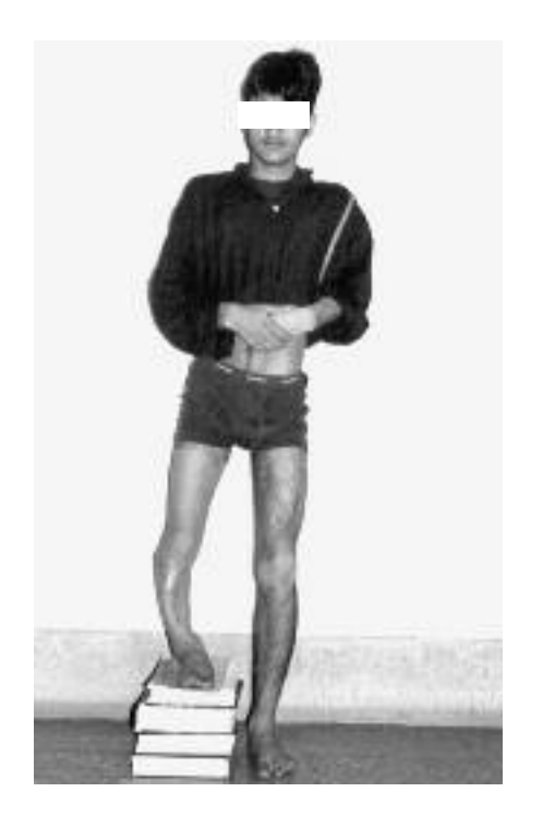
Fig. 1. — Preoperative photograph of the patient showing shortening of his right leg.

osteomyelitis at the age of 9 years. Over the years he had multiple abscess drainages, and was left with a stiff left hip and a severely deformed right leg. Huntington's procedure for centralization of the right fibula had been performed at the age of 11 years. At the time of presentation to our clinic, the patient had an ankylosed left hip and a deformed right leg. On examination a total shortening of 22 cm was calculated with a contribution of 4 cm and 18 cm respectively for the femur and tibia (fig 1). There was a full range of motion at the right hip and knee with no movements at the ankle. The radiograph of the right leg revealed a well-hypertrophied tibialized fibula, however with multi-planar deformities comprising of varus, procurvatum, internal rotation at the proximal end, and the ankle was fused with a varus deformity at the distal end of the centralized fibula (fig 2).