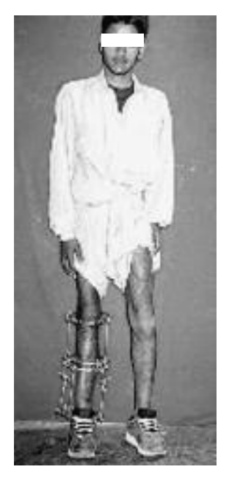
Fig. 5. — Clinical photograph during the period of consolidation.

After length equalization and deformity correction the frame was left in place till consolidation of the regenerate (fig 5). During the whole process of treatment the patient was encouraged to do physiotherapy and weight bearing as tolerated. A total of 20 cm length was achieved in the centralized fibula (fig 6). The patient retained excellent range of motion of the ipsilateral knee (fig 7). It took a total of 17 months for the consolidation of the regenerate and removal of the fixator (fig 8). At the fourth year of follow-up the patient is very happy with the end result of the procedure. Apart from minor pin tract infection, there were no major complications.