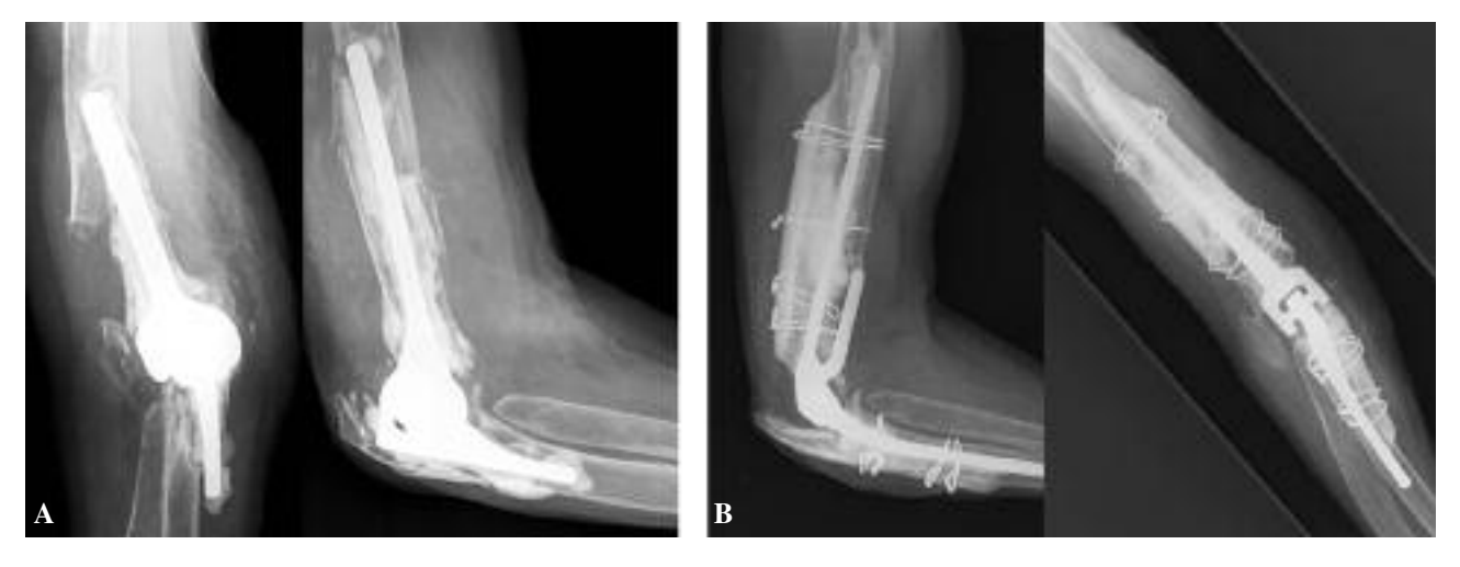
Fig. 2. — Preoperative (A) images with fractured ulna and humerus in case 2 and the radiological result after 2.5 years (B). The allografts show a bony bridge on ulna and humerus.

All patients were invited for clinical and radiological evaluation. One patient could not come to the clinic due to social problems and was contacted by phone and through her general practitioner. A new clinical and radiological evaluation was scheduled with a mean follow-up period after revision surgery of 19 months (range, 10-29). At the time of evaluation a standard radiograph, a