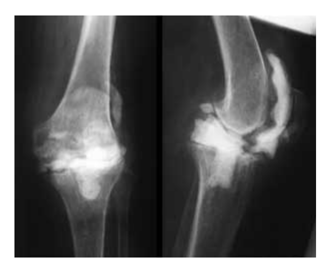
Fig. 2. — Case 2, the preoperative radiographs showed erosions of the lateral condyle and anterior cortex and broken cement spacers (tibial and femoral).

the mechanical limb axis and epicondylar axis was possible (fig 3). Preoperative planning took 35 and 30 minutes respectively for case 1 and 2. This was about 15 minutes longer than for standard planning of a primary TKA. Re-implantations were performed using a standard surgical technique according to the protocol for primary TKA.