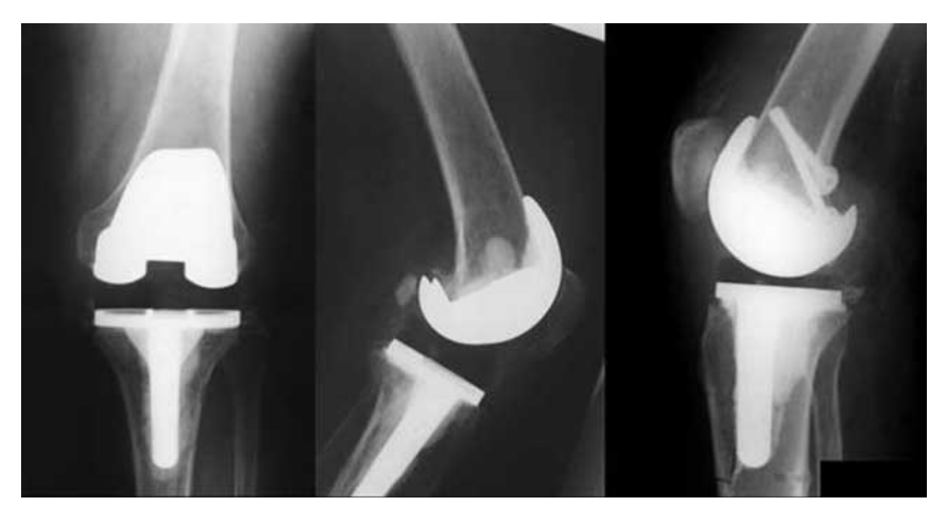
Fig. 6. — Postoperative radiographs – correct alignment of the implants. Right side : Case 1 – screw fixation of the insertion of the medial collateral ligament. Left side : Case 2.

the most successful method for eradication of infection with success rates ranging from 53 to 100% (7). Single-stage exchange arthroplasty has been successful in single cases or small series (3). Despite the advantage of less surgery and soft tissue damage, as well as maintenance of motion and lower costs, results and patient outcome in onestage are inferior to those in two-stage exchange arthroplasty (7). In 1987 Borden and Gearen (3) first used antibiotic-impregnated cement beads or a block spacer for two-stage delayed reimplantation. They found a 90% eradication rate. The use of an articulating PMMA spacer is helpful to maintain flexibility of soft tissue during the period of prolonged explantation of components (10).