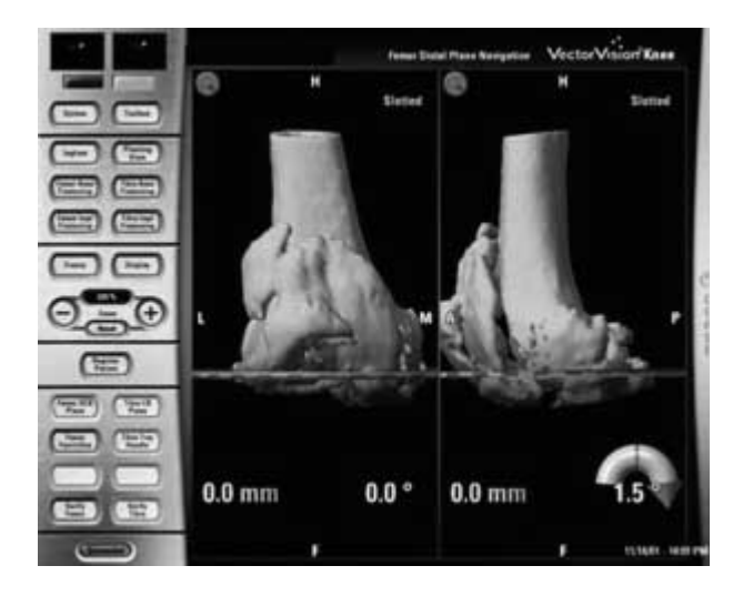
Fig. 5. — Navigation of the distal femoral cutting plane in real time (case 2).

matching, 20 points of free choice were marked on the bone-cement surface of both the femur and tibia (fig 4). Even in the case with the broken spacer blocks, acceptable accuracy was achieved for each surface matching process. The distal femoral cut-