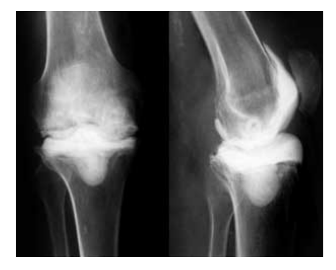
Fig. 1. — Case 1, the preoperative radiographs showed the femoral and tibial cement spacers in their original position.

Case 1 : A 73-year old man was treated with a temporary cement spacer, due to early infection of a primary TKA with Pseudomonas aeroginosa . He received oral antibiotics (Ciprofloxacin) for 3 months postoperatively, until blood parameters of