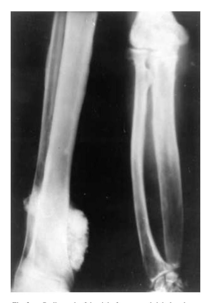
Fig. 3. — Radiograph of the right forearm and right leg shows the diaphysitis with some calcific areas in the marrow, the so-called 'calcific myelitis'.

different sittings, as they were quite large and infiltrating tendons and muscles, making dissection tedious. The tumours were polycystic within a thin fibrous capsule. On sectioning, the mass showed yellowish pasty calcareous material and there was a gritty sensation. Milky fluid was found in the elbow swelling.