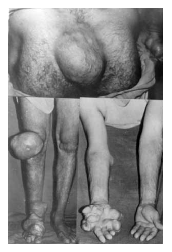
Fig. 1. — Photograph showing the large sacral lesion top), right sided large knee, ankle and foot lesion (bottom left) and the right elbow and hand lesions (bottom right).

gripping ; this led him to opt for amputation of the right little finger.