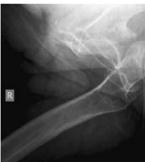
Fig. 1 & 2. — Radiographs showing a Thompson & Epstein type I posterior dislocation of the right hip.

Epstein type I posterior dislocation of the right hip (fig 1 & 2, table I). Furthermore, there were no signs of avascular necrosis, heterotopic ossification or osteoarthritis. The hip was reduced under anaesthesia, using the Allis maneuver (I). Post reduction radiographs showed that the reduction was congruous and that there were no associated fractures.