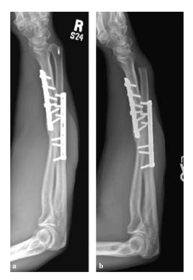
Fig. 1. — A 32-year-old man with long standing malunion of the radius and distal radioulnar joint instability presented with complaints of pain and supination limited to 10^{\circ} .

a : An oblique radiograph shows the malunion and malalignment of the distal radioulnar joint.