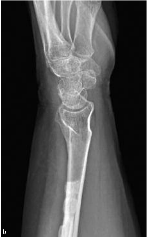
Fig. 2. — A 65-year-old woman had a nonunion of her ulna after an ulnar shortening osteotomy and 2 subsequent surgeries to try to gain union. a and b : Posteroanterior and lateral radiographs after removal of the distal part of the ulna. Her pain was resolved and function fully