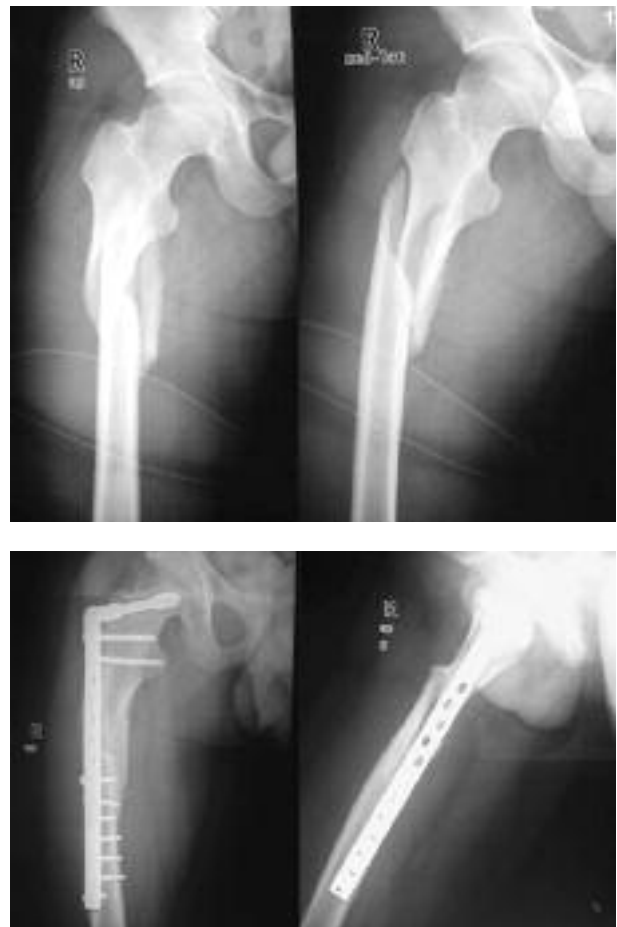
Fig. 2. – Case 1. a : Pre-operative radiograph ; b : Radiograph showing fracture union with good callus formation.