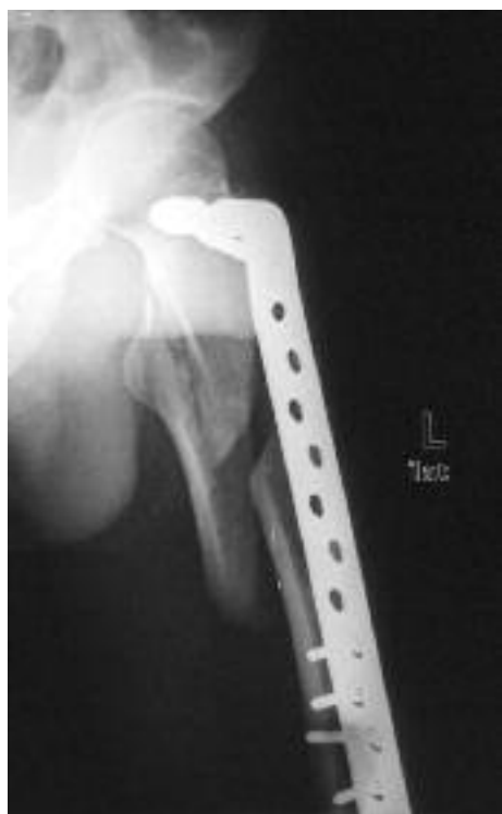
Fig. 3. – Technical failure secondary to inadequate reduction

rating scale, results were excellent in 45% cases good in 50% and poor in 5%. There was no statistically significant difference using the Fischer exact test between the healthy and fractured sides with respect to femoral shaft-neck angles ( p = 0.11 ).