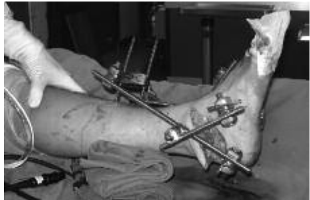
Fig. 5. — Case 2 : post-reduction and external fixation

radiographs showed complete relocation of the talar body within the ankle mortise and subtalar joint. The wound healed without problems. Antibiotics were further administered for 6 weeks. After 10 weeks, the external fixator was removed and weight bearing in a walking boot was allowed. Three weeks later, the cast was removed and gradual range-of-motion exercises were started. Four months after the injury, radiographs showed preservation of the joint line without signs of avascular necrosis. Hawkins sign was negative (fig 6). At this