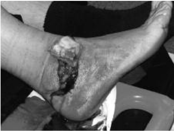
Fig. 3. — Case 2 : clinical picture