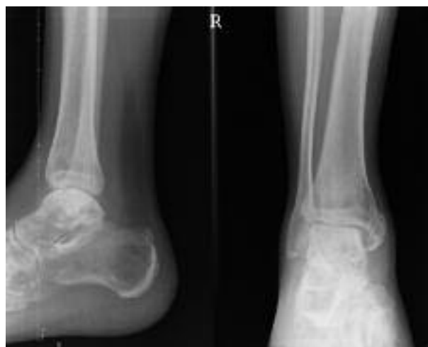
Fig. 2. — Case 1 : post-reduction image

dislocation. The talus was completely dislocated in an anterolateral direction with an associated undisplaced fracture of the medial malleolus (fig 1). After reduction of the shoulder, the patient was brought to the operating room. The wound was debrided and irrigated under general anaesthesia. Broad spectrum antibiotics were administered. All talar soft tissue attachments were found to be disrupted, except for a small strand from the talonavicular ligament. Traction was applied to the calcaneus using a Steinman pin and pressure was exerted over the talus in a posteromedial direction, thus reducing it. A tibiocalcaneal external fixator was applied to maintain the reduction. The wound was primarily closed. He was hospitalised for 5 days for neurovascular follow-up and intravenous antibiotic perfusion. After 8 weeks the external fixator was removed and range-of-motion exercises were started. Weight bearing was gradually allowed in a walking boot. Twelve months after the injury, he reported experiencing moderate pain during weight bearing. He was not able to walk without aid of crutches. He regained a painfree range of motion with a mild restriction of pro- and supination. Radiographs at 12 months follow-up showed complete union of the medial malleolar fracture, preservation of the tibiotalar joint space and no signs of avascular necrosis. Hawkins' sign was negative (fig 2).