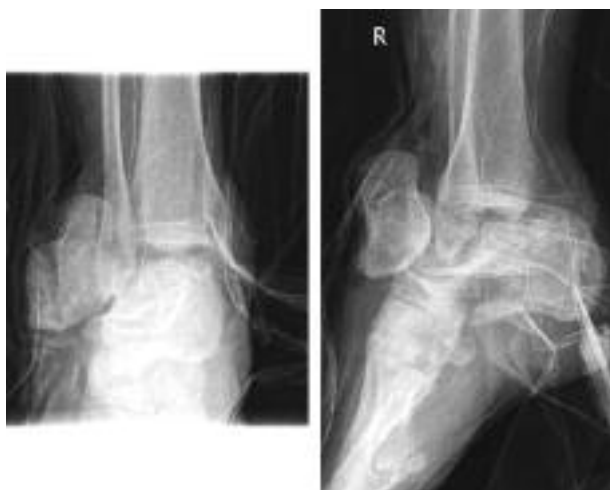
Fig. 1. — Case 1 : initial radiograph