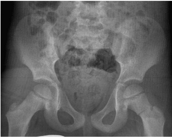
Fig. 2. — Type II fracture left, AP view