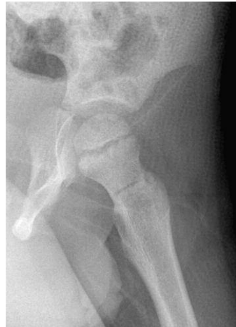
Fig. 3. — Type II fracture. Lateral view

may be difficult in an infant, as the femoral head is not yet ossified. Clinically, the limb is usually positioned in flexion, abduction and internal rotation. The differential diagnosis includes developmental dislocation of the hip and septic arthritis of the hip joint. An arthrogram and MRI may sometimes be necessary. Type I fractures have also been described following closed reduction of a traumatic dislocation of the hip (14).