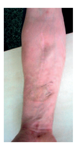
Fig. 1d. — Appearance of the donor site one year post-operatively.