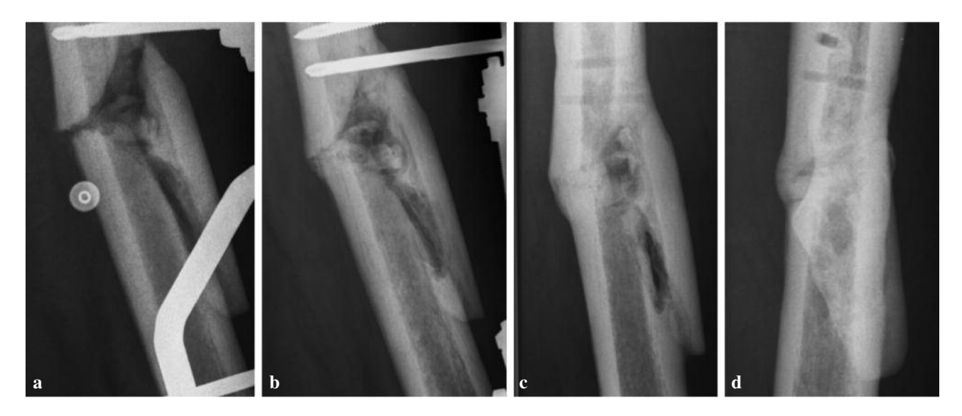
Fig. 3. — Illustration of the mechanotransduction principle with progressive callus formation during gradual compression after removal of the nail at 4 (a) and 10 (b) weeks with final healing at 7 months (c) and further remodelling at one and a half year (d).