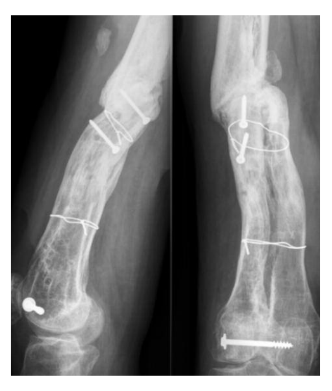
Fig. 2. — Final healing with consolidation of non-union and completely remodelled distraction area.