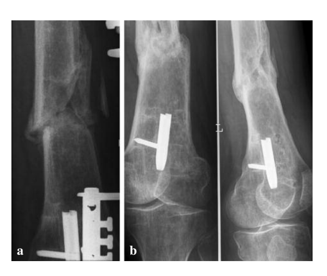
Fig. 5. — Non-union under compression (a) and final healing (b) with distal nail fragment in situ .

Postoperatively weight bearing was encouraged from the second postoperative day on, and gradual compression initiated in all patients at a rate of twice 0.25 mm per day. The three patients who needed a lengthening started the additional gradual adaptation of their osteotomy at postoperative day 7, at a rate of 0.75 mm per day. Follow-up with radiographic control was done at two week intervals. If cortical bridging was visible on at least one incidence, the circular frame was reduced to a simple unilateral fixator under a short general anaesthesia. Removal of the frame was carried out if complete consolidation was visible as cortical bridging of at least three cortices on four radiological incidences or on CT scan with sagittal and frontal reconstruction images. After removal of the external fixator no further protection was used and physiotherapy continued till knee flexion reached at least 90°.