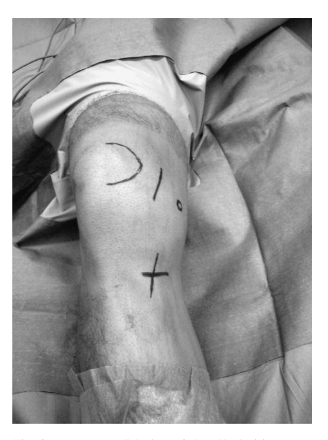
Fig. 3. — Anteromedial view of the skin incisions: one halfway between patella and medial femoral epicondyle and one small obliquely running incision at the gracilis distal insertion site.

autograft, leaving the attachment to the patella intact and turning this graft 90^{\circ} medially (16). Although they reported 'promising results' with this technique and no recurrence of dislocation, we