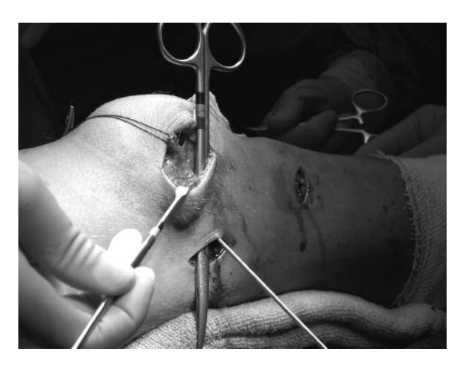
Fig. 4. — Sagittal view from a medial perspective showing the alternative approach with three incisions. The tunnel underneath the medial retinaculum and vastus medialis obliquus is illustrated by the dissection scissors.