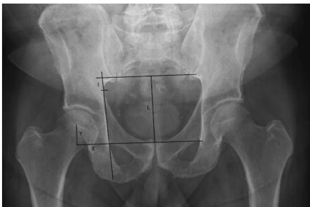
Fig. 1. — Analysis of pelvic radiograph according to Fessy et al (11) (method 1). L is the vertical distance between the inter-teardrop line and the inter-sacroiliac line, I the distance between the contact point of the medial ilium with Koehler's line and the inter-sacroiliac line.

which served as a reference for the centre of the hip joint. All authors who reported their calculation methods performed their measurements on pelvic radiographs of individuals with normal hips.