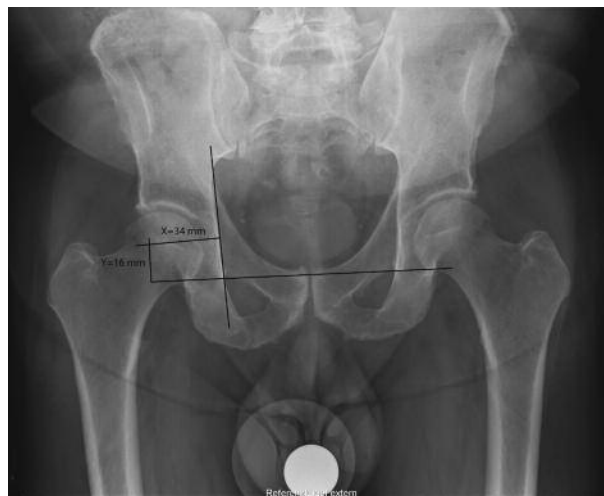
Fig. 2. — Analysis of pelvic radiograph according to Fessy et al (11) (method 2). The mean perpendicular distances from Koehler's line (X) and the inter-teardrop line (Y) are indicated.

Fessy et al (11) defined the mean horizontal distance (X) from a perpendicular to the inter-teardrop line and the mean vertical distance (Y) from a perpendicular to Koehler's line (fig 2). Koehler's line and the inter-teardrop line were drawn on x-ray images, and the hip joint centre was located : the mean X distance was 33.6 mm and the mean Y distance was 16.34 mm.