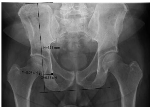
Fig. 3. — Analysis of pelvic radiograph according to John and Fisher (18) (method 3). The inferior teardrop figure is marked by a black dot; the hip joint centre is defined relative to this point by mean horizontal (X) and vertical (Y) distances normalized by pelvic height (H).