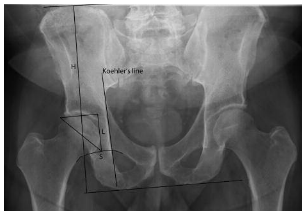
Fig. 5. — Measurement on pelvic radiograph according to Ranawat et al (26). The pelvic height (H) is measured, and a right isosceles triangle is constructed starting about 5 mm lateral to the intersection of Shenton's line (S) and Koehler's line. The size of the triangle L is one fifth of pelvic height H.

The exact magnification factor of pelvic radiographs is usually unknown and cannot be determined without a