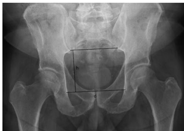
Fig. 4. — Analysis of pelvic radiograph according to Pierchon et al (25). The hip joint centre was determined by using the mean distance from the teardrop figure as published by Pierchon et al . Distances were normalized by the inter-teardrop distance (d, method 4) and the distance between the inter-teardrop and inter-sacroiliac line (h, method 5) as shown above.

centre from an isosceles right triangle located 5 mm laterally from the intersection of Koehler's and Shenton's line. The side length of the triangle was defined by one fifth of pelvic height and the edge of the acetabulum (fig 5).