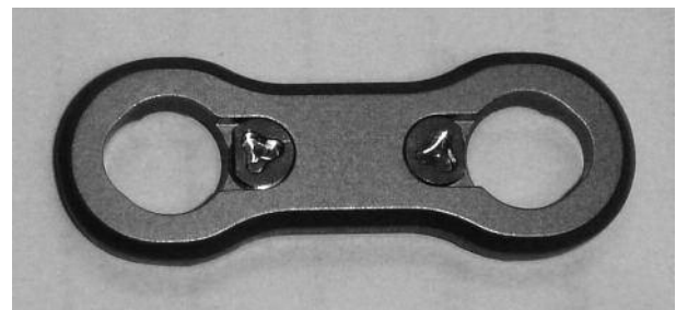
Fig. 1. — Anterior view of the Uniplate® anterior cervical plate.

one-level and even more so with two-level ACDF, significantly enhanced fusion, supporting its use in the treatment of cervical spondylosis. One of the problems encountered with this approach is that the use of a Caspar intersomatic distractor and a classical 4-screws plate requires drilling three holes in each vertebral body. This may weaken the vertebral body and result in a loose grip of the screws. For this reason, the author chose to use a midline plate (fig 1), secured by only one screw per vertebra