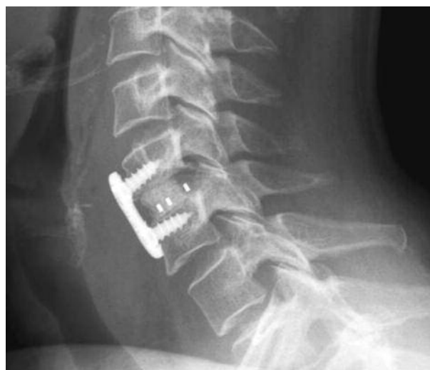
Fig. 3. – Cervical spine antero-posterior and lateral view after anterior cervical discectomy and fusion using a PEEK cage filled with tri-calcium phosphate bone substitute and the Uniplate® system.

screws per vertebral body. The plate is low profile, semi-rigid, 10.5 mm wide, 2.3 mm thick, maintained by a single screw in each vertebra, and secured by a tri-lobe locking mechanism. We asked the manufacturer (DePuy Spine) to slightly diminish the diameter of the Caspar pins, in order to make it possible to slide the plate over the Caspar pins, which were then removed and replaced by screws with appropriate length.