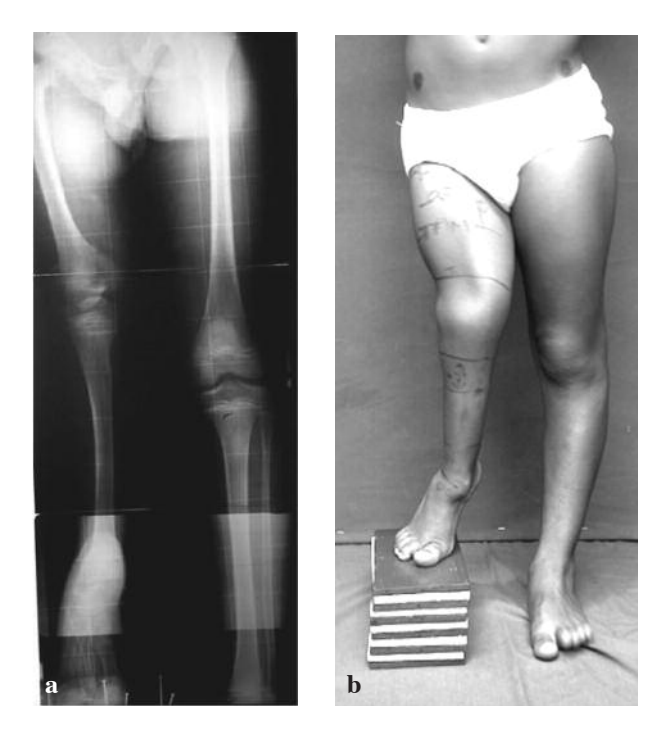
Fig. 1. — (a) Preoperative radiograph of a 13-year-old boy showing shortening and deformity associated with proximal focal femoral deficiency; (b) Preoperative clinical picture of the same patient.

Group A included two cases of hip subluxation. The first case occurred in a 4-year-old boy with proximal focal femoral deficiency (PFFD) and required lengthening of 11cm with a Paley difficulty score of 13. After lengthening of four centimetres, superior migration of the femoral head was observed, requiring termination of lengthening and application of an abduction brace. The hip joint was reduced but the desired amount of lengthening could not be achieved. The second case was a 13-year-old boy, with PFFD and fibular hemimelia (fig 1a, b). The required lengthening was 18 centimeters. After lengthening of 15 centimeters, hip dislocation was observed. The patient