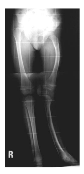
Fig. 3. — Preoperative orthoroentgenogram showing the previously lengthened tibia with deformity and residual shortening as well as shortening at the femur in a five-year-old child with proximal focal femoral deficiency and fibular hemimelia.