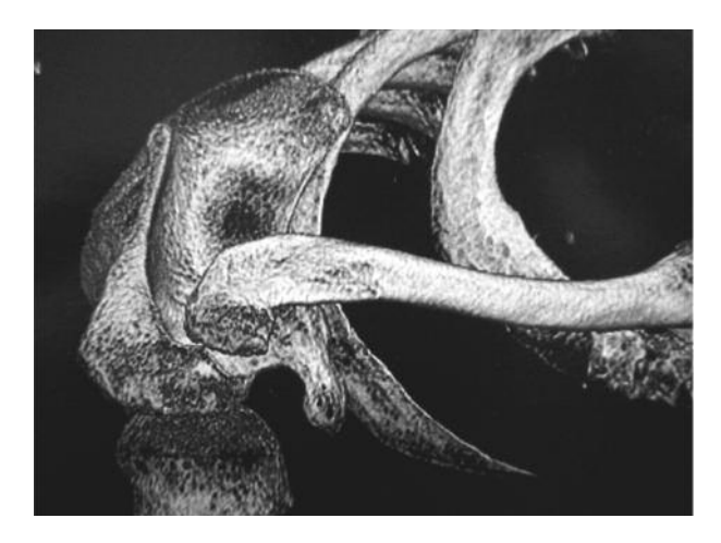
Fig. 4. - 3D CT reconstruction clearly shows the healed clavicle at 3 months.

None of these factors were identified in the case reported herein; hence we attribute the delayed union to an unknown lack of biological factors.