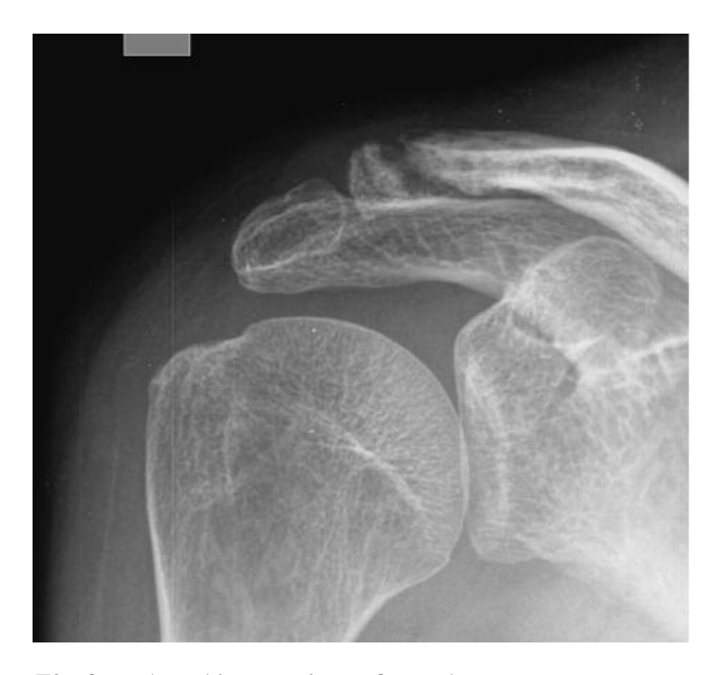
Fig. 2. — Atrophic nonunion at 8 months.

nonunion in fractures of the clavicle is much lower (0.1% to 0.8%) (17,19). The complex process of bone healing is regulated by local and systemic elements (18), and many factors can contribute to impede healing, thereby leading to nonunion. Extensive trauma, a large fracture gap, unstable fracture fixation, premature mobilization, infection, extensive osteonecrosis, comorbidities, inadequate blood supply, and older age have all been identified as factors that are unfavorable for bone healing (1,6,10,22).