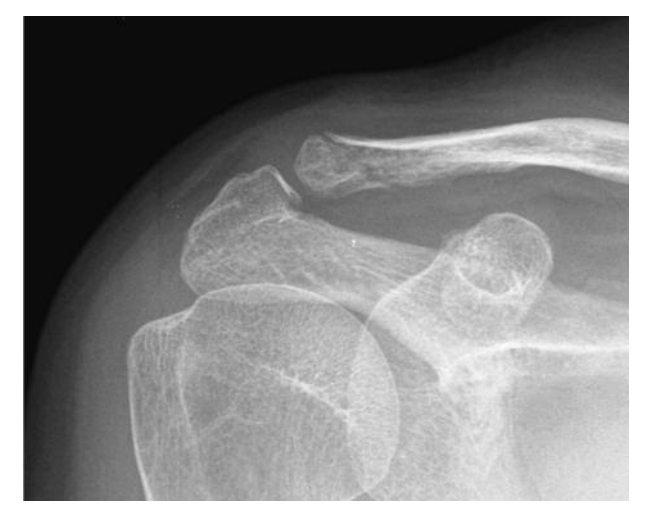
Fig. 1. — Initial radiograph showing fracture of the distal right clavicle.

Delayed union or nonunion occurs in 5% to 10% of all fractures (5,14,19), although the incidence of