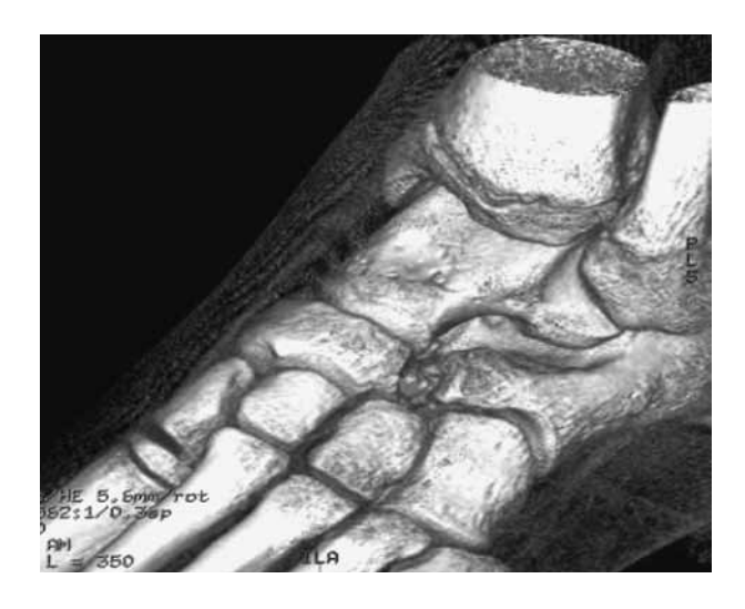
Fig. 2. - CT scan after coalition resection

we asked for swelling, clicking or catching of the foot or ankle. Stiffness was defined as a sensation of restriction or slowness in the ease when moving the joint in the morning or later in the day. We asked specifically how often they experienced pain, whether it was related to any specific movement and whether or not pain was sustained during the night. To assess the function in daily living we inquired about walking on stairs, rising from sitting, walking and shopping, putting on and taking off socks and stockings and light and heavy domestic duties. To evaluate sports activities we asked for pain or symptoms with running, jumping, twisting and kneeling. Finally we were interested in their quality of life. We checked if the patients had modified their life style to avoid certain activities and asked them how often they were aware of their foot problem. They were asked to fill in the questionnaire and send it back.