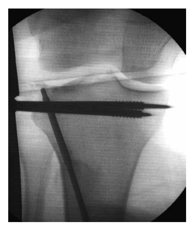
Fig. 2. — Fluoroscopic image demonstrating the syringe being railroaded over the K-wire.