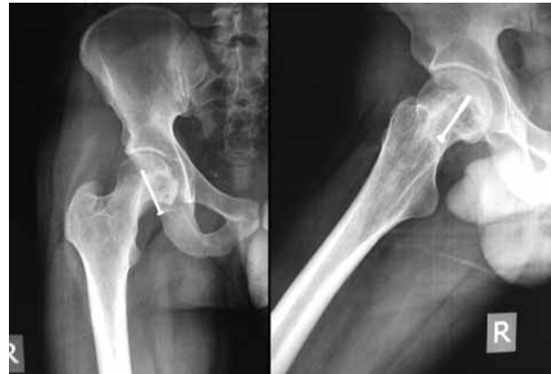
Fig. 4. — Three and half years after excision of the tumour and allograft reconstruction of the defect, radiographs show graft union without signs of recurrence.

Postoperative recovery was uneventful and immobilisation was done for 6 weeks. The biopsy samples from the tumour margin did not show any remnant of tumour. Skin traction was applied to the lower limb in an abducted position. This method of immobilization kept the joint distracted and avoided undue force over the graft. Active hip joint flexion and extension in abducted position (with traction in situ ) was initiated within the first week. Bedside mobilisation was started after three weeks. After 6 weeks, partial weight bearing was allowed