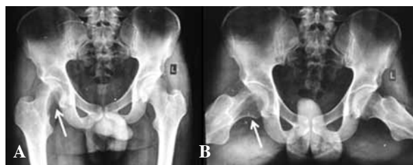
Fig. 1A,B. — Antero-posterior and lateral radiographs of pelvis with bilateral hip joints show a large radiolucent lesion in the inferior part of the femoral head on the right side.

Histological confirmation of the diagnosis was obtained by performing a needle biopsy under CT guidance. The histological picture showed multinucleated giant cells (10-30 nuclei) admixed with stromal fragments in a background of blood. The nuclei of stromal cells and multinucleated giant