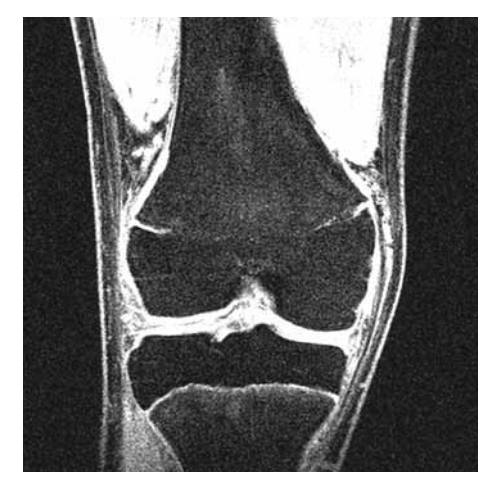
Fig. 4. — T2-weighted magnetic resonance image demonstrating a central osseous physeal bar.

After exposure of the fracture site on the medial side, a gentle valgus stress was used to dislodge the interposed periosteum (Fig. 3). The periosteum was sutured to the proximal periosteum, a stable anatomic reduction was achieved, and a long leg