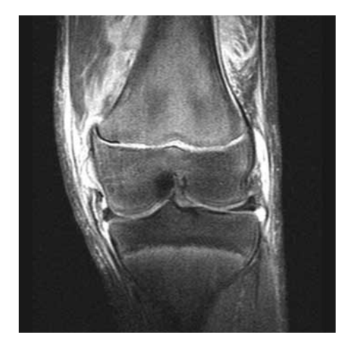
Fig. 6. — T2-weighted magnetic resonance image showing entrapped periosteum on the medial side of the distal femoral physis.

A 12+10-year-old male was struck on the lateral aspect of his right knee by an opposing player's helmet while playing football. Upon admission to the emergency department, the patient's neurovascular status was intact. Radiographs demonstrated a Salter-Harris II fracture and widening of the distal femoral physis (Fig. 5). An MRI showed entrapped periosteum on the medial side of the distal femoral physis (Fig. 6). The patient underwent an open reduction of the distal femoral physeal fracture with removal of the entrapped periosteum. A stable anatomic reduction was obtained and maintained (Fig. 7). Seven months following the injury, a subsequent MRI demonstrated greater than 50% closure of the physis. A scanogram demonstrated a LLD of 1.8 cm. A LLD of 4-5 cm