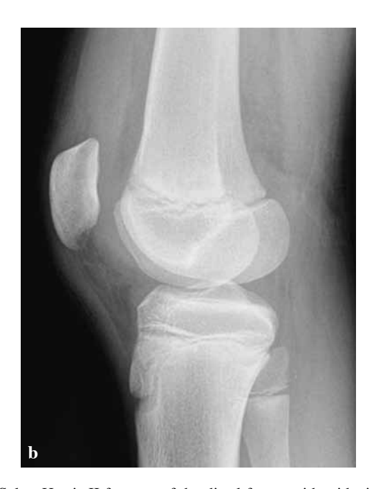
Fig. 1a & 1b. — Anteroposterior and lateral radiographs demonstrating a Salter-Harris II fracture of the distal femur with widening of the physis medially.