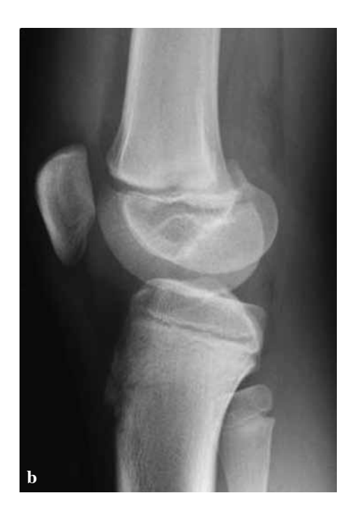
Fig. 5a & 5b. – Anteroposterior and lateral radiographs demonstrating a Salter-Harris II fracture with widening of the distal femoral physis.

arrest of the growth plate and prevent potential angular deformity. The patient and family wished to address potential limb length discrepancy (LLD) at skeletal maturity.