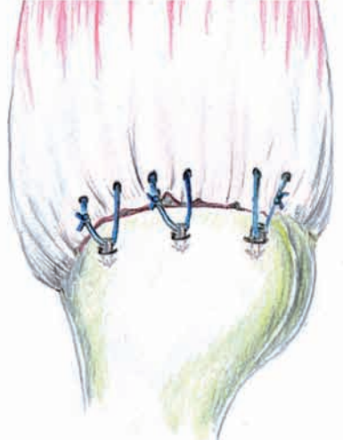
Fig. 2. — Single-row repair to the prepared bone bed (crescent-shape tears).