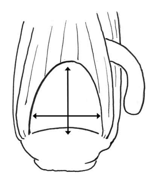
Fig. 5. — Measurement of greatest tear diameter of supra/ infraspinatus with probe.

On average, 2.8 anchors (range 1 to 6) were used per shoulder for repairing the cuff tendons. Margin convergence was used in 42 of the 49 cases (86%)