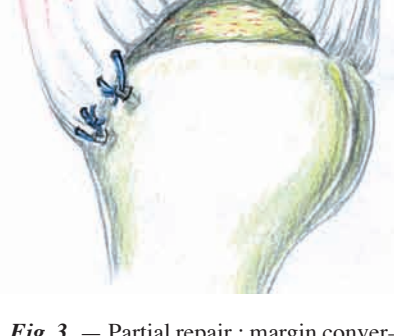
Fig. 3. — Partial repair : margin convergence and posterior leaf reattachment.

Fig. 1. — Margin convergence repair (U- or L-shape tears) reducing strain on tear margins.