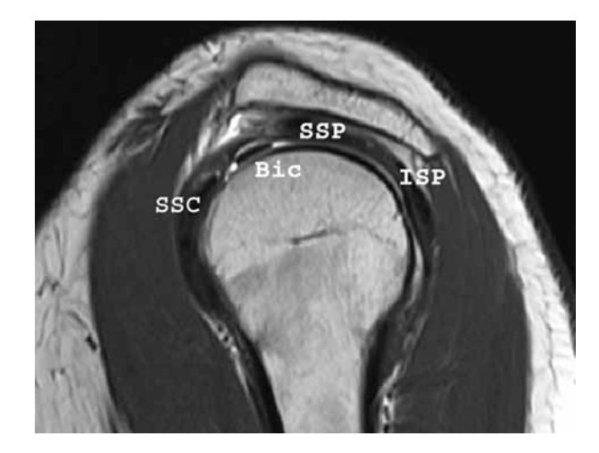
Fig. 6. — Parasagittal MRI slice close to cuff attachment illustrating the strong (black) tendinous portion of superior subscapularis (SSC) and the anterior supraspinatus (SSP) on both sides of the biceps (Bic). Posteriorly the infraspinatus (ISP).

When comparing our results with the literature, we realize that, due to different definitions of a massive tear and different outcome measurements, a direct comparison with other published series is difficult. Cofield (8) presented a summary of results of open cuff repairs, where 87% of the patients had pain relief, but only 77% were happy with the outcome. Bigliani et al (1) presented their results in a