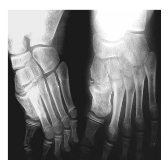
Fig. 3. — Radiograph of the right foot after 7 years follow-up showing filling of the tumour cavity with no evidence of local recurrence but with premature closure of the growth plate responsible for shortening of the first metatarsal.

Giant cell tumours in the foot are known to occur in a younger age group, more often in females and they tend to have a more aggressive behaviour both clinically and radiologically than in other locations (3,9,12,21).