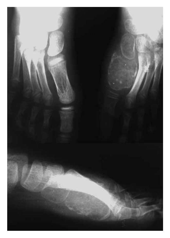
Fig. 1. — A destructive lesion involving the entire right first metatarsal bone with a very thin cortex fractured at places and no periosteal reaction or new bone formation.

a blown-up appearance with several microfractures. Adjacent soft tissue swelling was also noted. There was no periosteal reaction or new bone formation (Fig. 1). Chest radiographs and laboratory tests, including serum calcium and phosphorus levels, were normal.