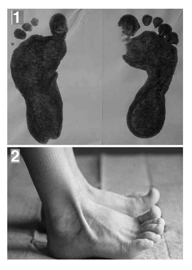
Fig. 3. — A unilateral clubfoot where the right side is affected, 11 years post-operatively. (1) the footprints; (2) dorsiflexion of both feet shows the transferred tibialis anterior tendon.

In all cases of the unilaterally affected group the heelcord alignment with the tibia axis appeared to be normal. The shape of the foot in comparison with the unaffected side as it appears in the foot prints (fig 3-1) was near to normal except for the