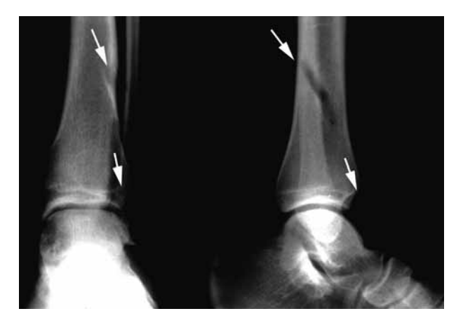
Fig. 5. — Anteroposterior and lateral radiograph of the distal tibia. The imprint of the transferred tibialis posterior tendon on the tibia shaft as it is seen 30 years postoperatively.

In clubfoot the main problem in all surgical procedures described so far is that they do not sufficiently address the tibialis posterior tendon, not only because of its underlying abnormality (3, 7) but also because the latter goes together with shortness of the flexor hallucis longus and flexor digitorum longus tendons. Anterior transfer of the tibialis pos-