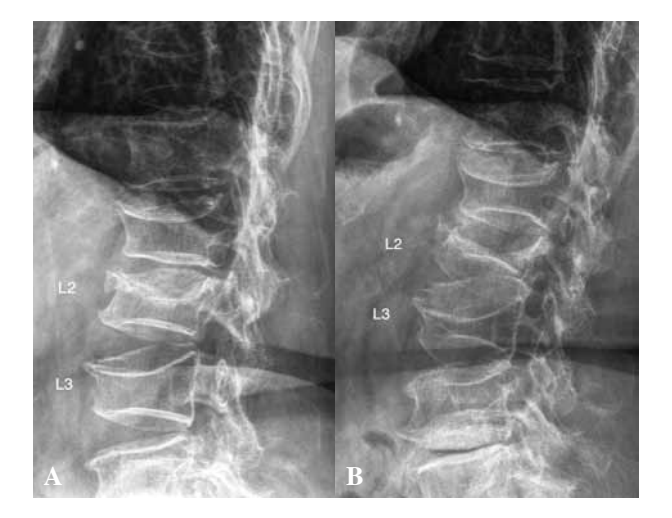
Fig. 1. - Lumbar spine radiography. (A) Lateral view at initial visit revealed a concave deformity at L2 and L3. (B) One month later, further deformity lead to the diagnosis of L2 and L3 vertebral compression fractures, and vertebroplasties were scheduled.