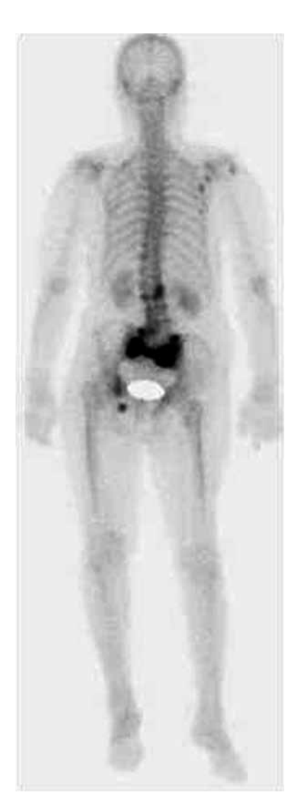
Fig.3. — Bone scan showing marrow oedema bilaterally in the sacral alae at 6 months postoperatively. The typical Honda sign implied sacral insufficiency fracture.

by MRI and the desired depth and angle of penetration into the S1 and S2 bodies were marked and recorded. After induction of general anaesthesia, the patient was placed prone on the radiolucent table. Two image intensifiers (PHILIPS, Best, The Netherlands) were used to provide anteroposterior and lateral views during surgery. The skin on her back was prepared and draped. Four single-use Jamshidi<sup>®</sup> needles were inserted into S1 and S2 bilaterally near the SI joints. The non-ionic iodinated contrast medium iopromide (Ultravist, Berlex