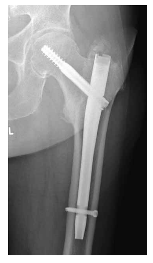
Fig. 1. — Gamma 3-Nail

Five complications were observed (Table II). One peripheral nerve injury (foot drop) due to peroperative traction was noted postoperatively. Two failures occurred in both the Gamma 3 group (3.2%)