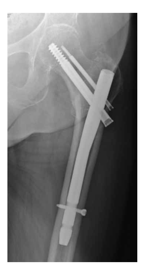
Fig. 2. – ACE Trochanteric Nail

statistically significant difference between the two groups. The same applied to the Merle d'Aubigné subgroup scores.