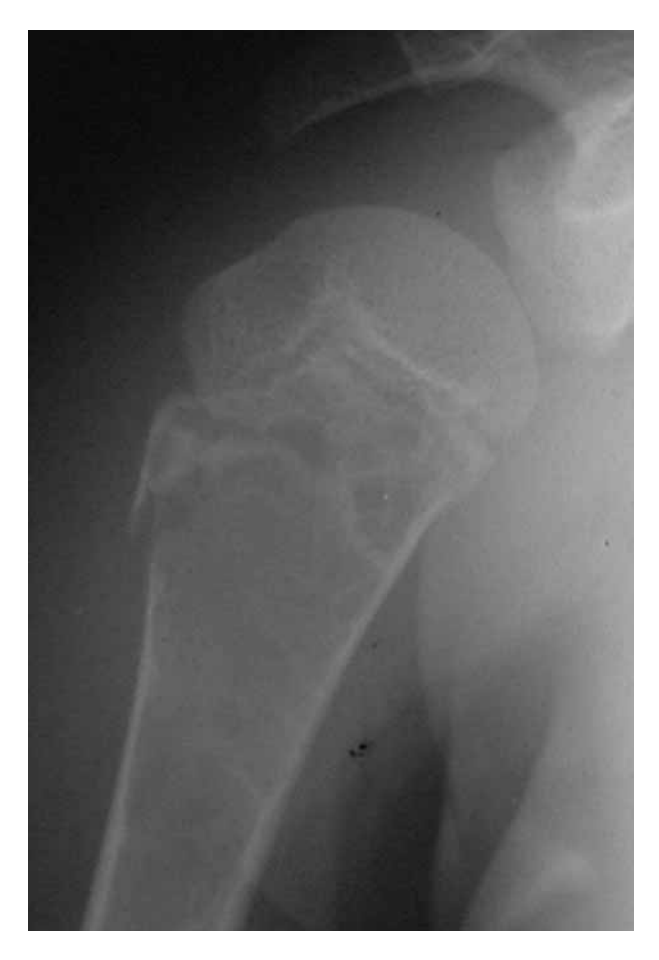
Fig. 1. —A six-year-old girl with a pathological fracture of the proximal right humerus through a simple bone cyst (case 1).

that the cyst had begun to heal, but there was a one centimetre shortening of the humerus. At age 14 the patient was asymptomatic but the discrepancy measured seven centimetres, and the cyst was still present, without varus or valgus deformity.