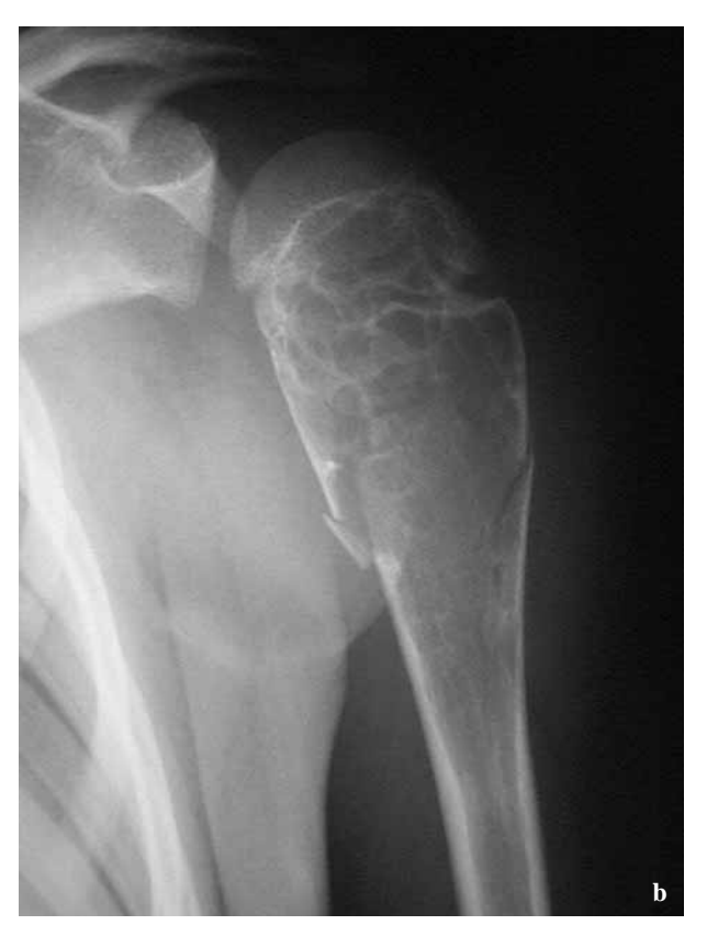
Fig. 4. — Erosion of the physis in a 9-year-old patient (case 4)