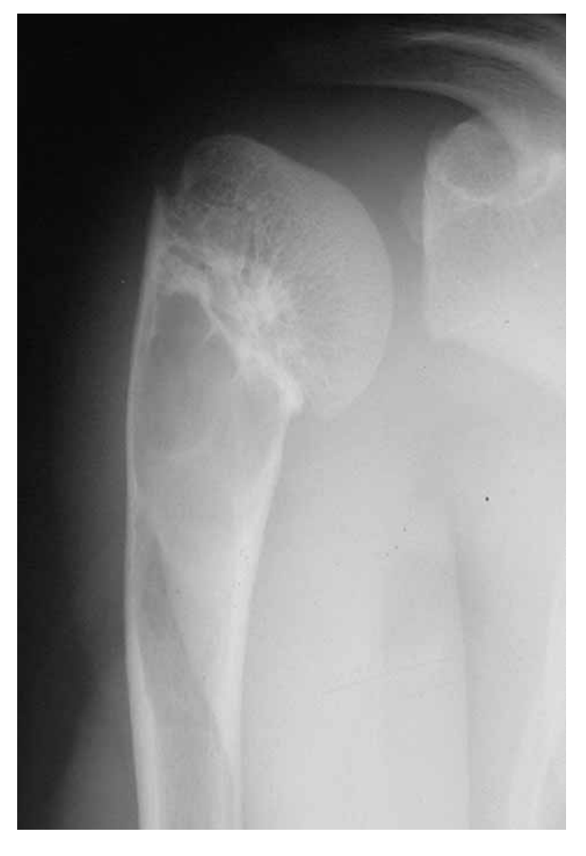
Fig. 2. — Recurrence of the cyst and varus deformity in a nine-year-old patient (case 2).

Case 2 : The second case was a four-year-old boy who was seen after a fall. A pathological fracture of the right proximal humerus was diagnosed. Initial treatment consisted of immobilisation in a sling for four weeks. Two months after the accident a biopsy confirmed the diagnosis of benign cyst, and a corticosteroid injection was performed (80 mg prednisolone). The patient was examined five years later at age nine, because of limited abduction and shortening of the arm (4 cm). Radiographs revealed a varus deformity, and recur-