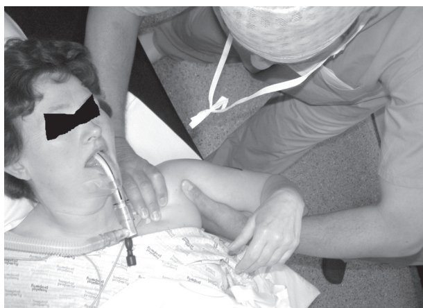
Fig. 1. — Manipulation technique : note the position of the surgeon's hands that diminishes the lever arm force acting on the shoulder.

definitive audible and palpable snap represents capsular tearing may be felt on each manoeuvre. The resultant improvement in range of motion in all directions following manual manipulation was recorded. An interscalene nerve block with Bupivacaine for post operative analgesia was routinely used.