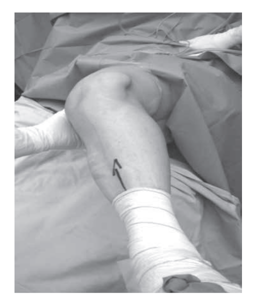
Fig. 2. — Valgus stress test resulting in frank lateral patellar dislocation without applying any force to the patella itself.

the posterior oblique ligament (POL) were clearly identified. Although all three ligamentous structures showed continuous fibers, these ligaments seemed extremely floppy or abundant. According to Hughston (17), the complete medial ligamentous complex was detached from the femur with an Lshaped incision. The femoral end of the MPFL reconstruction was continued by creating a 6 mm bone tunnel starting at the native MPFL femoral insertion which was confirmed by fluoroscopic control according to Schöttle et al (32). The free ends of the gracilis allograft were passed between the two layers of the medial patellar retinaculum and inside the femoral tunnel. With the knee flexed at 60°, the free ends were fixed in the femoral tunnel using a PEEK interference screw (Biosure PK 6 × 25 mm screw, Smith&Nephew, Andover, USA), thus finishing the MPFL reconstruction. The sleeve containing the medial ligamentous complex was advanced proximally and anteriorly on the femur, following the technique described by Hughston (17). In this position, the sleeve was fixed to the medial femoral condyle using two suture loaded bone anchors (Twinfix 5.0 anchor, Smith&Nephew, Andover, USA), thus restoring proper tension in the medial ligamentary complex. The MCL plication