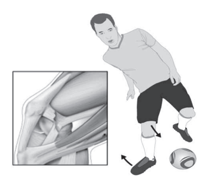
Fig. 4. — The femoral MPFL insertion site can be directly injured by a valgus injury sustained in the area of the femoral MCL complex insertion due to the close anatomical proximity of both ligamentous structures.

adductor tubercle (5,36) and extends anteriorly to the superomedial two-thirds of the patella. Disruption of the MPFL most commonly occurs in the fibers attached to the medial femoral epicondyle (35). As the MPFL courses anteriorly, its fibers fuse with the undersurface of the VMO tendon (26). The superficial MCL arises slightly proximal and posterior to the medial epicondyle, almost at the same place as the distal femoral attachment of the VMO. The most common location for MCL injury is the femoral insertion, accounting for 65% of the MCL tears. In the era before the first description of the MPFL as a distinct ligamentous structure, some reports not only mentioned injury to the medial retinaculum after an acute LPD but also the co-existence of lesions to the VMO insertion in these cases. Hunter et al (18) noted a femoral lesion of the MCL in 61% of the patients diagnosed with a disruption of the VMO from the adductor tubercle. Since the identification of the MPFL refined the knowledge of the precise anatomy of the medial retinaculum, it can be assumed that these authors noticed the same injury