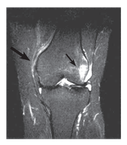
Fig. 1. - MRI study of the left knee reveals complete rupture of the sMCL and dMCL from the femur (large arrow). Bone bruise can be noted on the lateral femoral condyle, suggesting a valgus mechanism (small arrow).

the contralateral knee. Although the patient recalled this sensation as a minor component of his aforementioned episodes of giving-way, he clearly delineated this feature from instability during the valgus stress test.