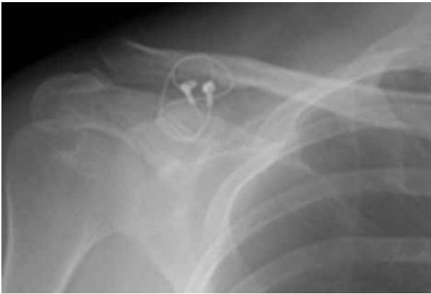
Fig 2. — AP views : coracoclavicular fixation with two multi-strand titanium cables. AC joints symmetrical.

11.0 ; SPSS Inc., Chicago, IL). A p < 0.05 was considered statistically significant.